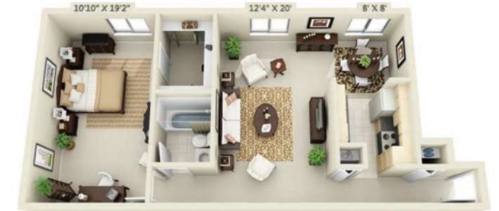
1 Bedroom, 1 Bath Plan D – 800 sf $ _____