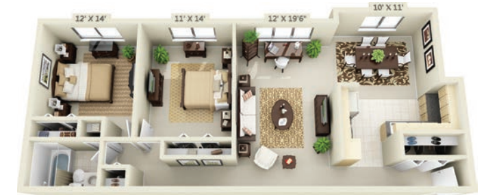
2 Bedroom, 1 Bath Plan C – 950 sf $ _____