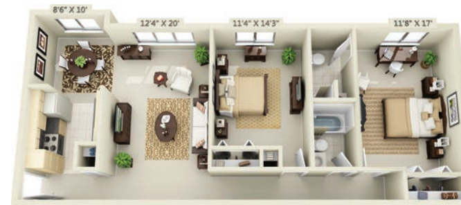
2 Bedroom, 2 Bath Plan E – 1,040 sf $ _____