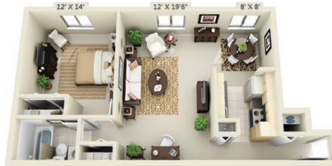
1 Bedroom, 1 Bath Plan A – 750 sf $ _____