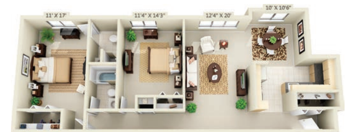
2 Bedroom, 2 Bath Plan F – 1,110 sf $ _____