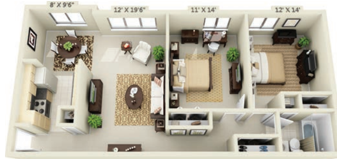
2 Bedroom, 1 Bath Plan B – 900 sf $ _____